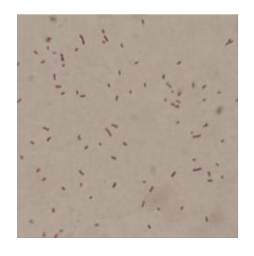
Figure 2 Gram Staining Result

Based on Figure 2, the microscopic results show the form of bacteria in the form of bacilli, red in color, gram-negative, and the bacterial structure spreads.