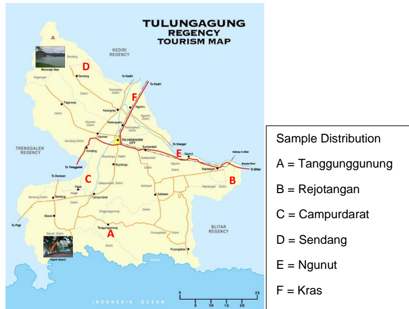
Figure 1. Collection of sample site locations on geological map.

were carried out at the Chemical Laboratory of STIKes Karya Putra Bangsa Tulungagung. The chemical used are \text{H}_2\text{C}_2\text{O}_4 0,01 N, NaOH 0.01 N, Indikator PP 1%, \text{AgNO}_3 0,0035 N, NaCl 0,0035 N, Indikator \text{K}_2\text{CrO}_4 5%, \text{Na}_2\text{EDTA} 0,03 N, \text{CaCl}_2 0,03 N, NaOH 3N, Ammonia buffer solution, pH 10 (Sigma-Aldrich).